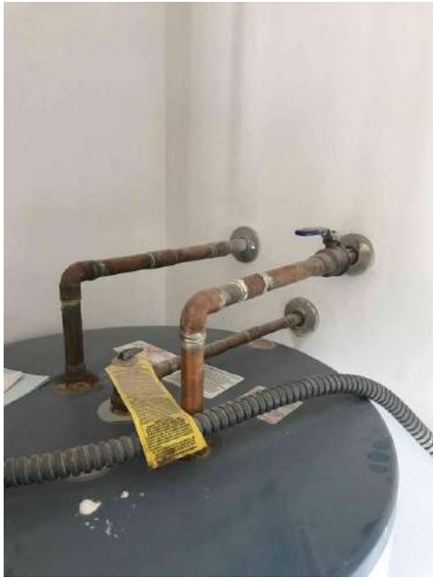
Under cabinet plumbing & drains